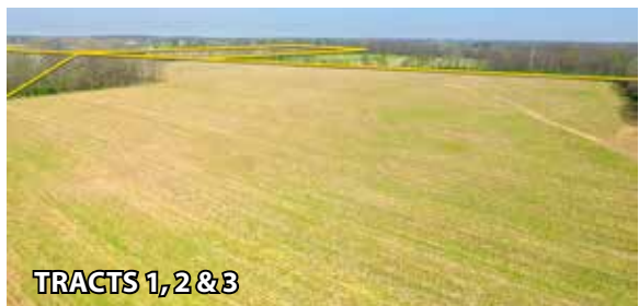
TRACTS 1, 2 & 3