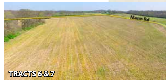
TRACTS 6 & 7

AUCTION TERMS & CONDITIONS: PROCEDURE: The property will be offered in 9 individual tracts, any combination of tracts and as a total 486± acre unit. There will be open bidding on all tracts and combinations during the auction as determined by the Auctioneer. Bids on tracts, tract combinations and the total property may compete.