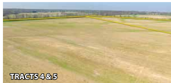
TRACTS 4 & 5