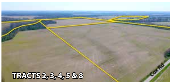
TRACTS 2, 3, 4, 5 & 8